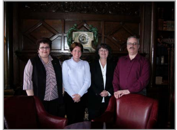
ORGANIZATIONAL OPERATIONS COMMITTEE