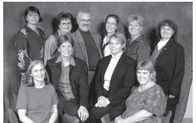
2003 / 2004 BOARD OF DIRECTORS TERM OF OFFICE JUNE 2003 – JUNE 2004